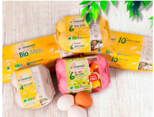
The Sonnenei range in imagic 2 ®

Now give me some of that climate neutral packaging